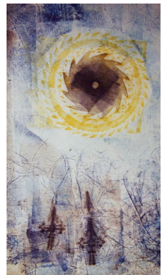
Sunflower by Sari Dienes.